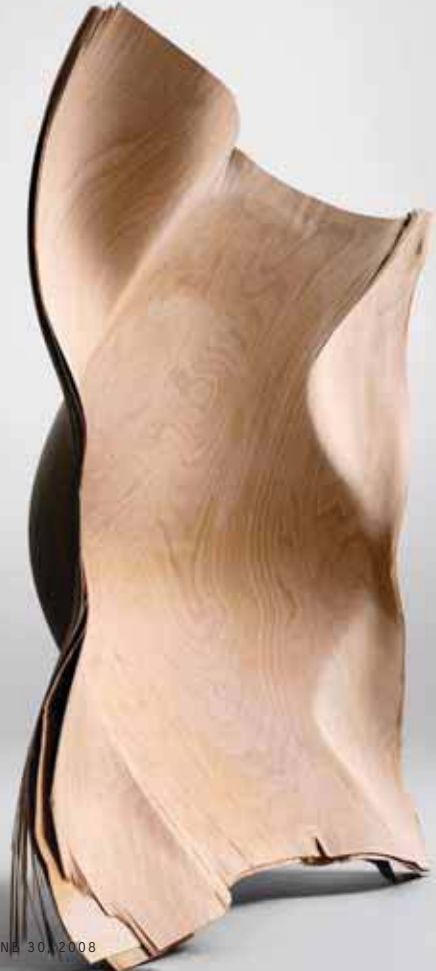
FIRST MOULDED PALMA SHELL JUNE 30, 2008

Like us, these suppliers are dedicated to producing well-designed furniture to the highest quality; building on the furniture making heritage and expertise that has steadily evolved in the region. Together we keep abreast of innovations and invest in the latest production methods that ensure we achieve cutting-edge results. We are proud to be contributing to the furniture making legacy of Tibro and sustaining local employment and valuable skill sets in Sweden.